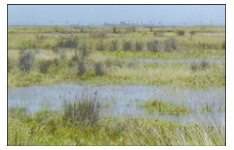
RLMC is helping to restore natural tidal inundation to part of the Tomago site

In addition to remediation works and allocation of land for environmental protection, RLMC has provided support to other important environmental projects.