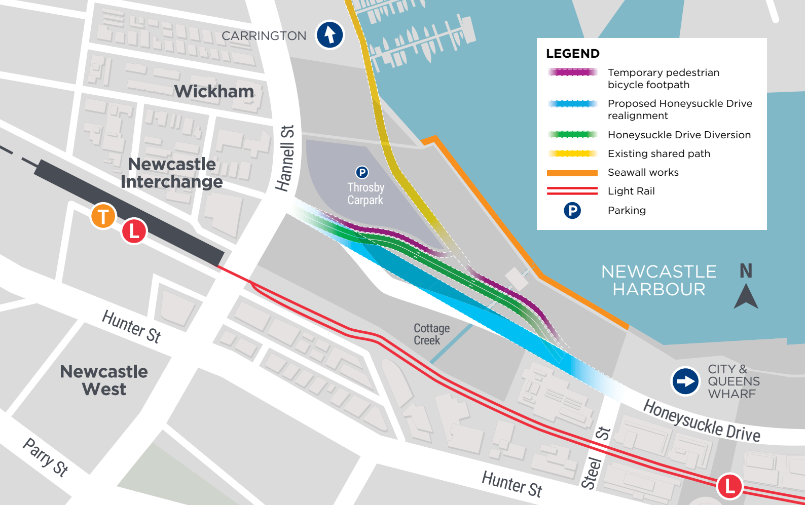
Road realignment and temporary paths.