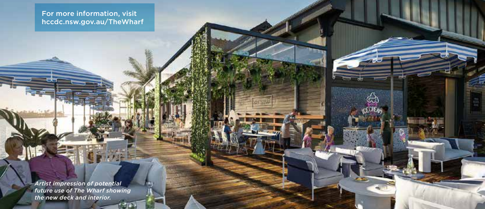
Artist impression of potential future use of The Wharf showing the new deck and interior.