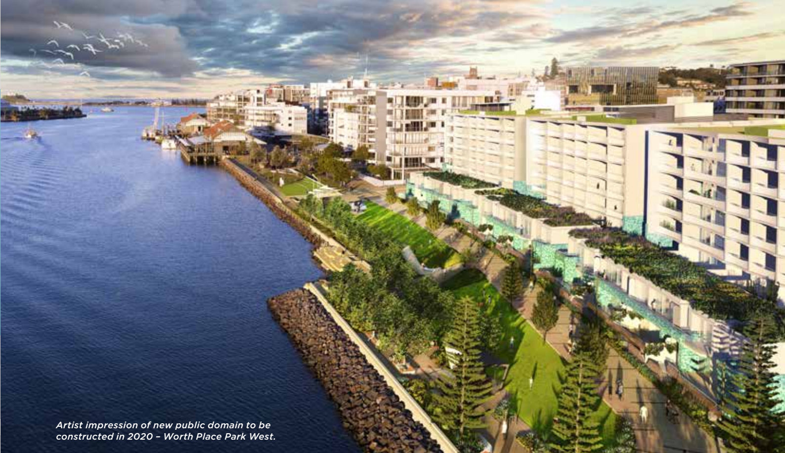
Artist impression of new public domain to be constructed in 2020 - Worth Place Park West.