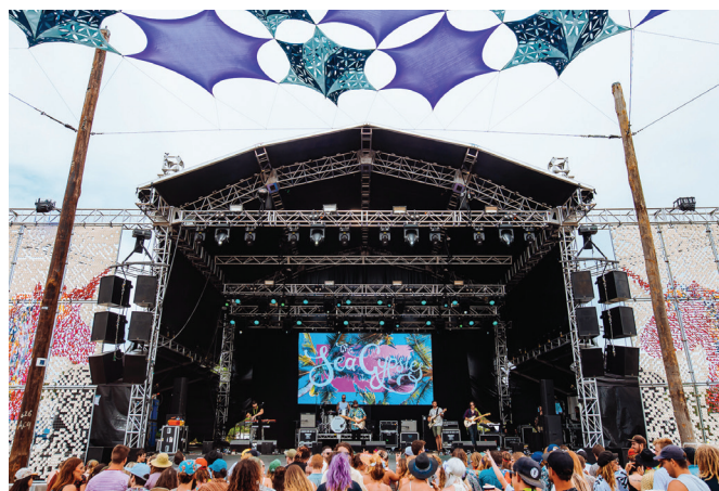
Mount Penang is home to key Central Coast events.

We are currently undertaking a program of works to supply water and sewerage services as well as road upgrades to parts of the site. This will enable private development and investment, allowing for more jobs, improved tourism and cultural outcomes that benefit the local area and broader region.