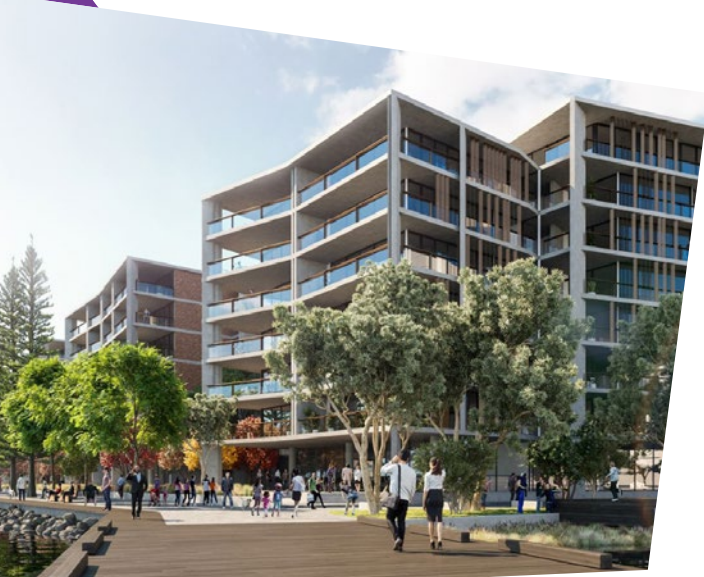
Horizon on the Harbour

HCCDC continues to work with community and industry stakeholders to lead the transformation of Honeysuckle and its surrounding precincts. Here's a short update on some of these projects.