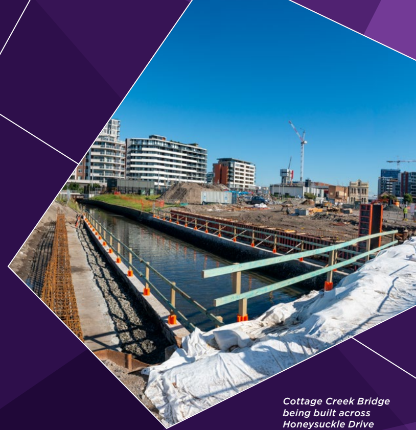
Cottage Creek Bridge being built across Honeysuckle Drive

Once completed, the new bridge will showcase the natural asset, as well as reduce flooding risk to the area. The entire project is on target to be completed by December 2020.